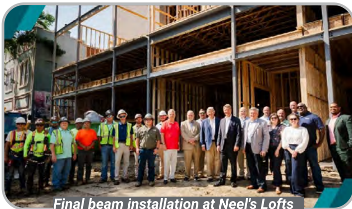
Final beam installation at Neel's Lofts